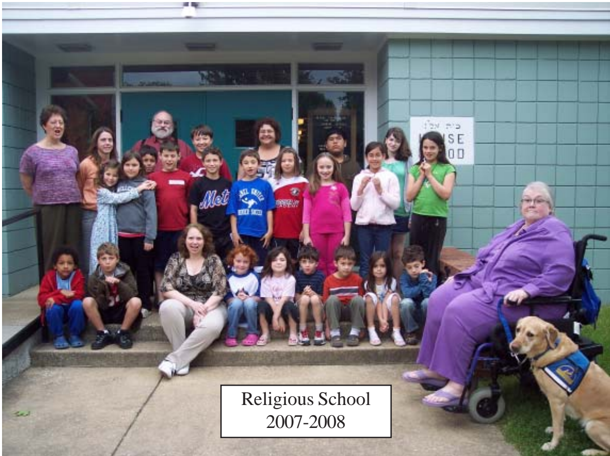
Religious School 2007-2008